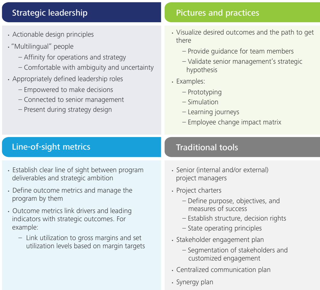
Figure 3. How a dynamic approach can help overcome a failure to translate strategy

Graphic: Deloitte University Press | DUPress.com